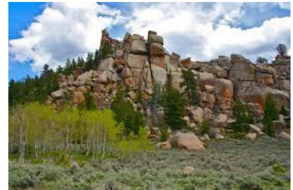
Happy Jack Recreation Area, Medicine Bow Forest