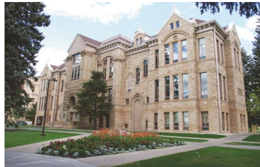
Old Main Central Administration Building