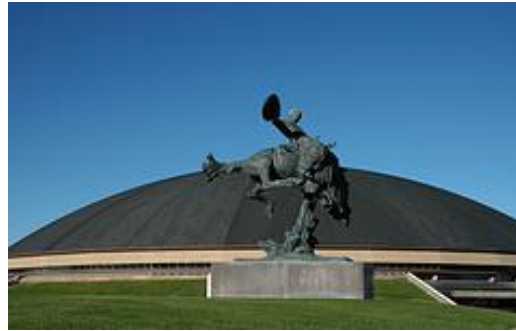
Arena Auditorium Basketball Complex