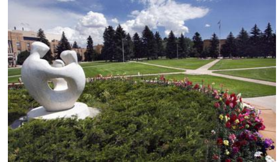
Prexys Pasture Center of Campus