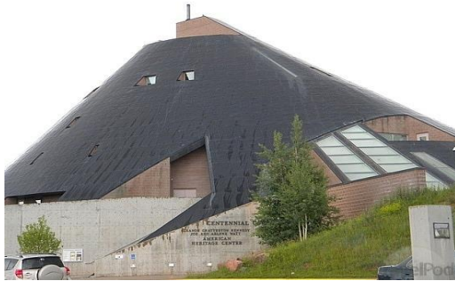
American Heritage Center & Art Museum