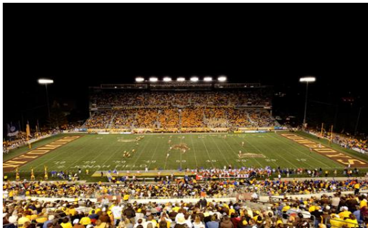
War Memorial Football Stadium